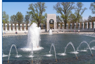
World War II Memorial