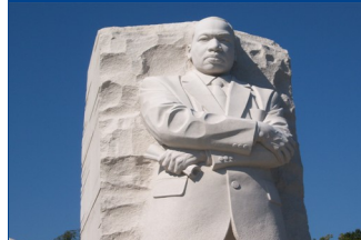
Martin Luther King, Jr. National Memorial