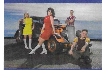
BEACH BOYS: CALIFORNIA DREAMIN'