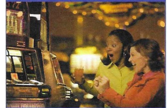
World-class Gaming and Excitement