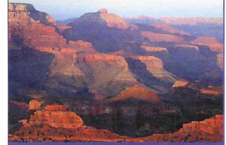
View the spectacular Grand Canyon