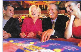
First Class Gaming