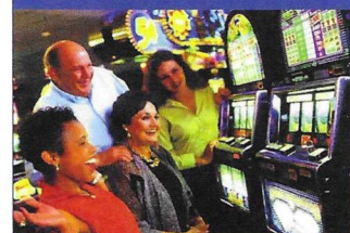
Give Lady Luck a Spin!