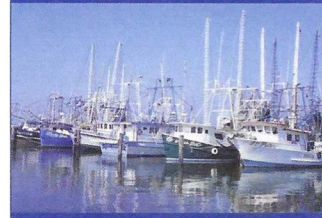
The Beautiful Gulf Coast Awaits